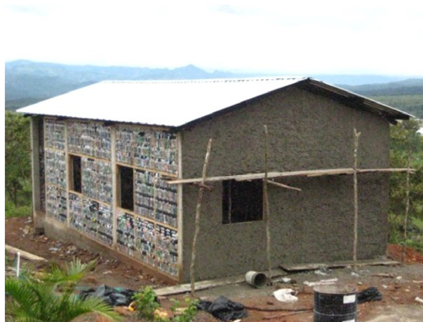
Plastic bottles and cob houses construction (Atitlàn, Guatemala)