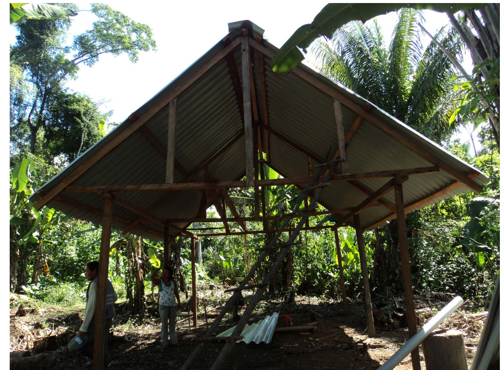
Construction Workshops and Safe Resettlement (Yurimaguas, Peru, 2011)