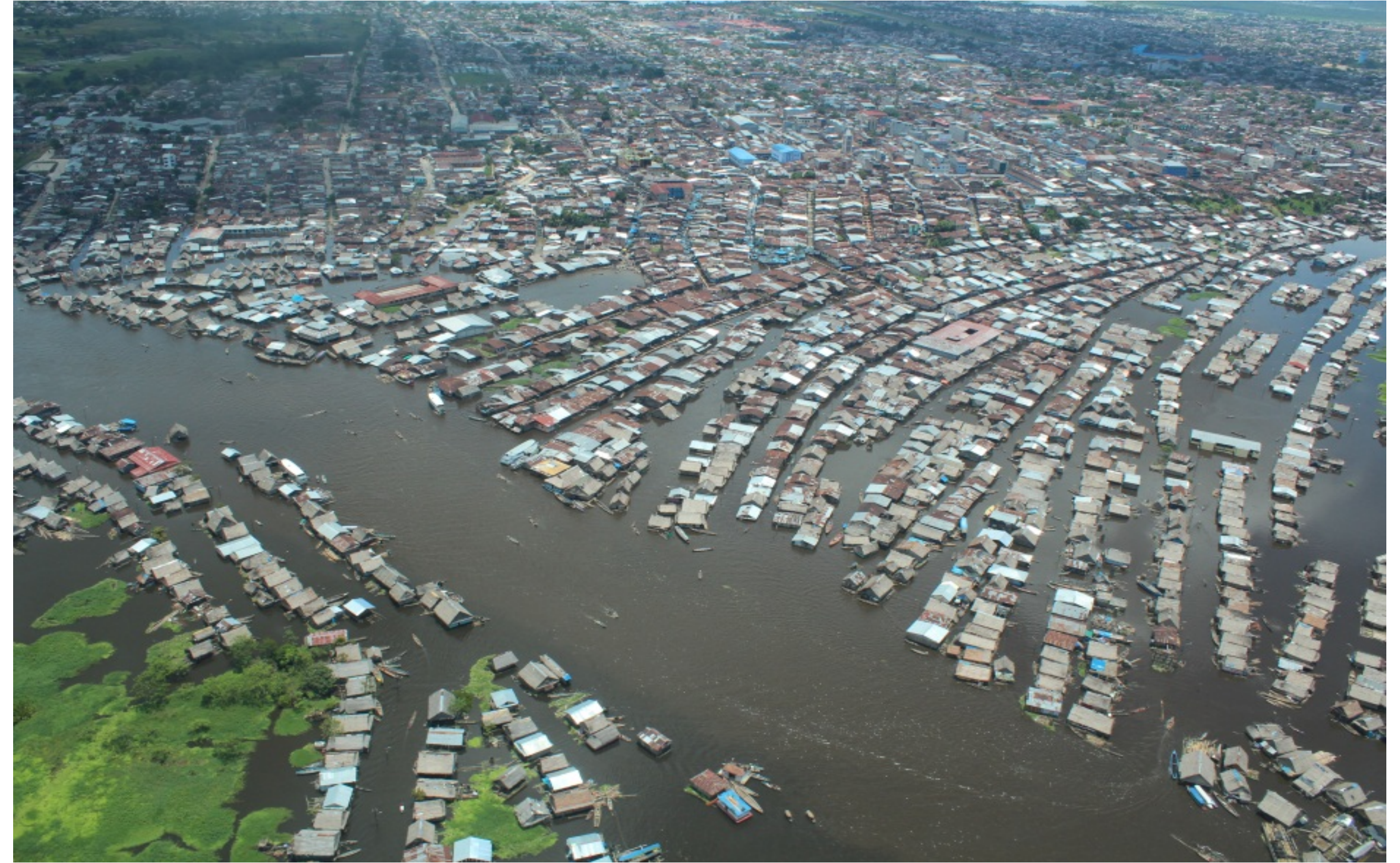
Vulnerability, threat, risk and disaster (Iquitos, Peru, 2011)