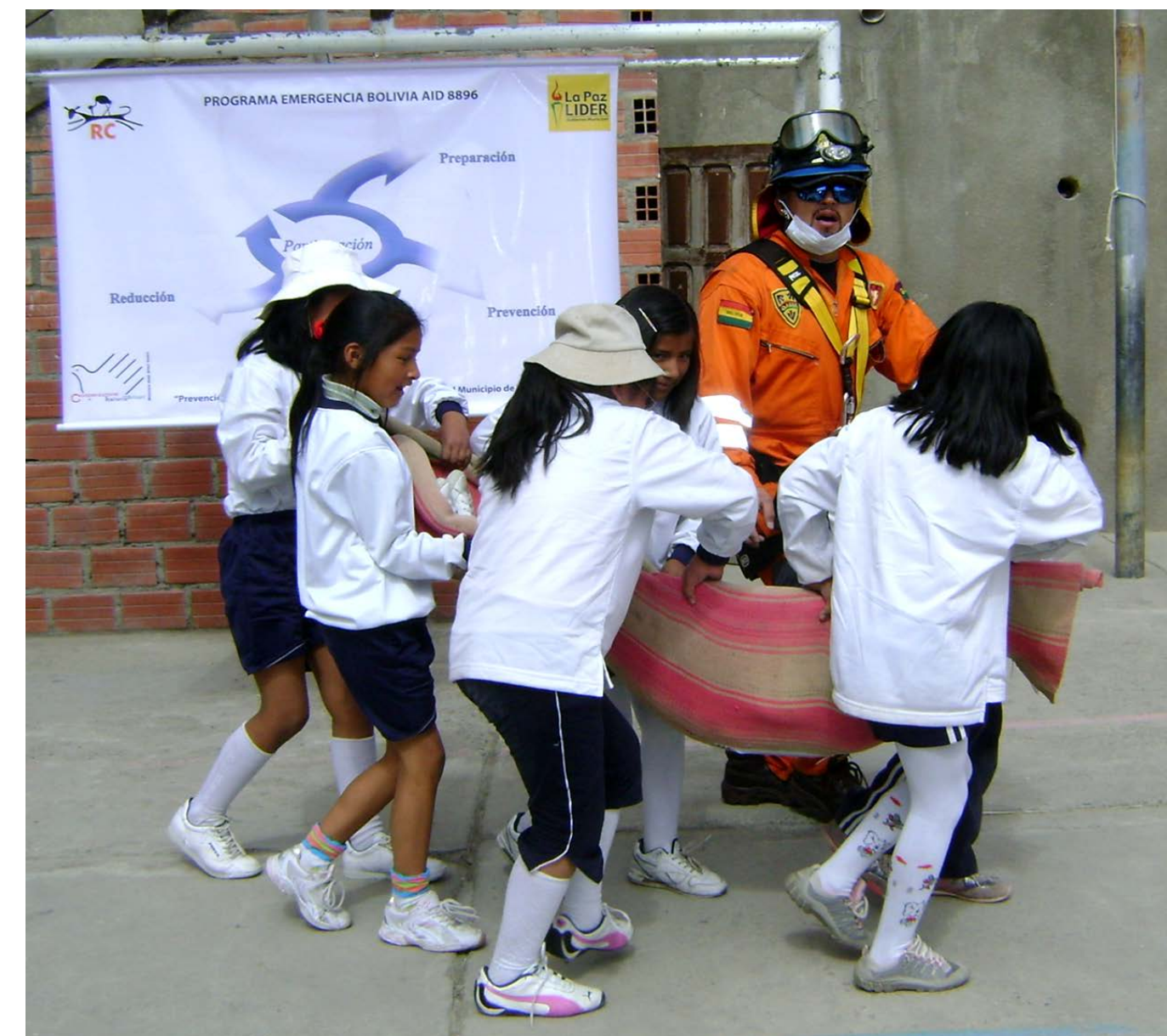
Disaster Preparedness Workshops with adults and children (La Paz, Bolivia, 2009)