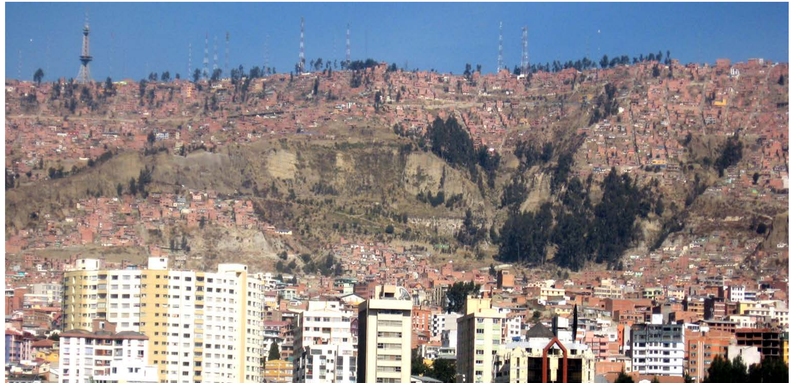
Conditions of vulnerability, threat and risk (La Paz, Bolivia, 2008)