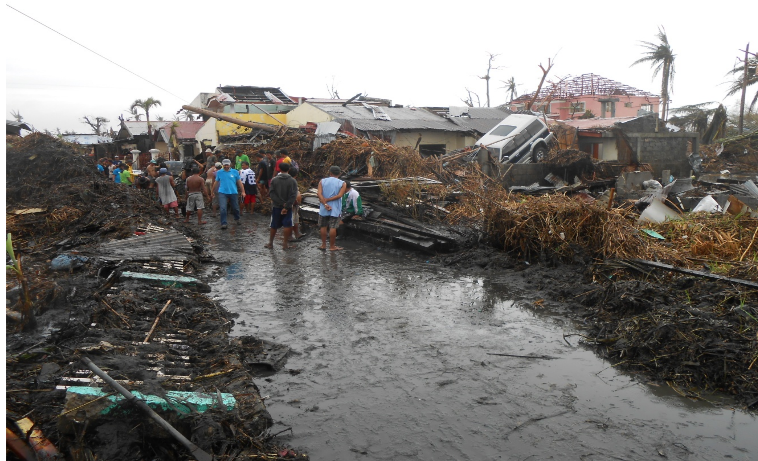
«Haiyan/Yolanda» Typhoon (Philippines, 2013)

They produce migrations (IDPs -Internal Displaced People- or EDPs -External Displaced People-) and poverty conditions .