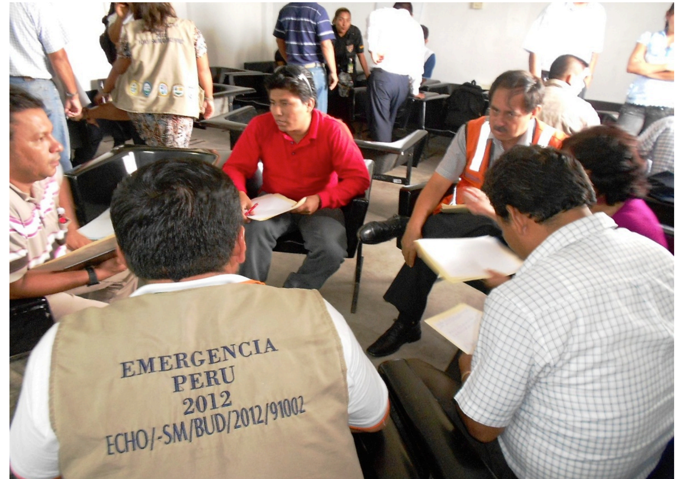
Disaster Preparedness Workshops with public bodies (Yurimaguas, Peru, 2011)