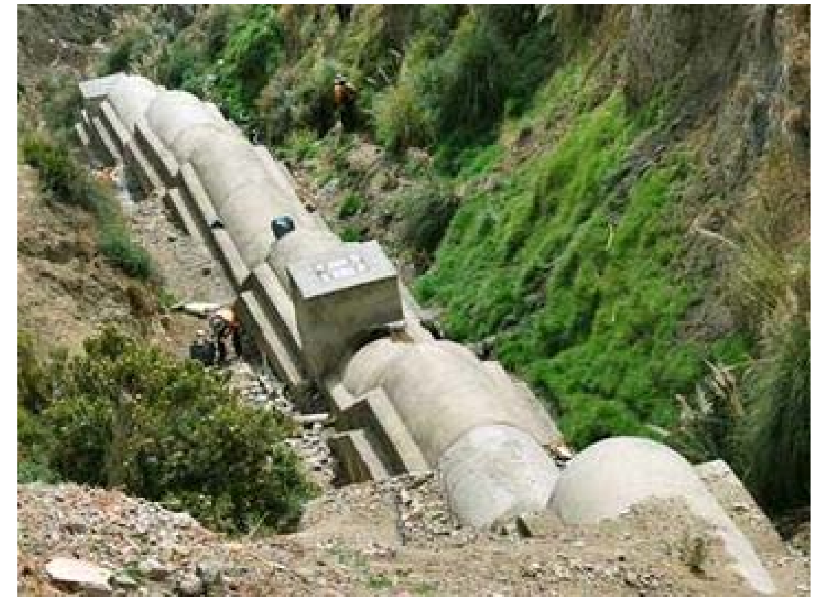
Cleaning and construction of water channels (La Paz, Bolivia, 2009)