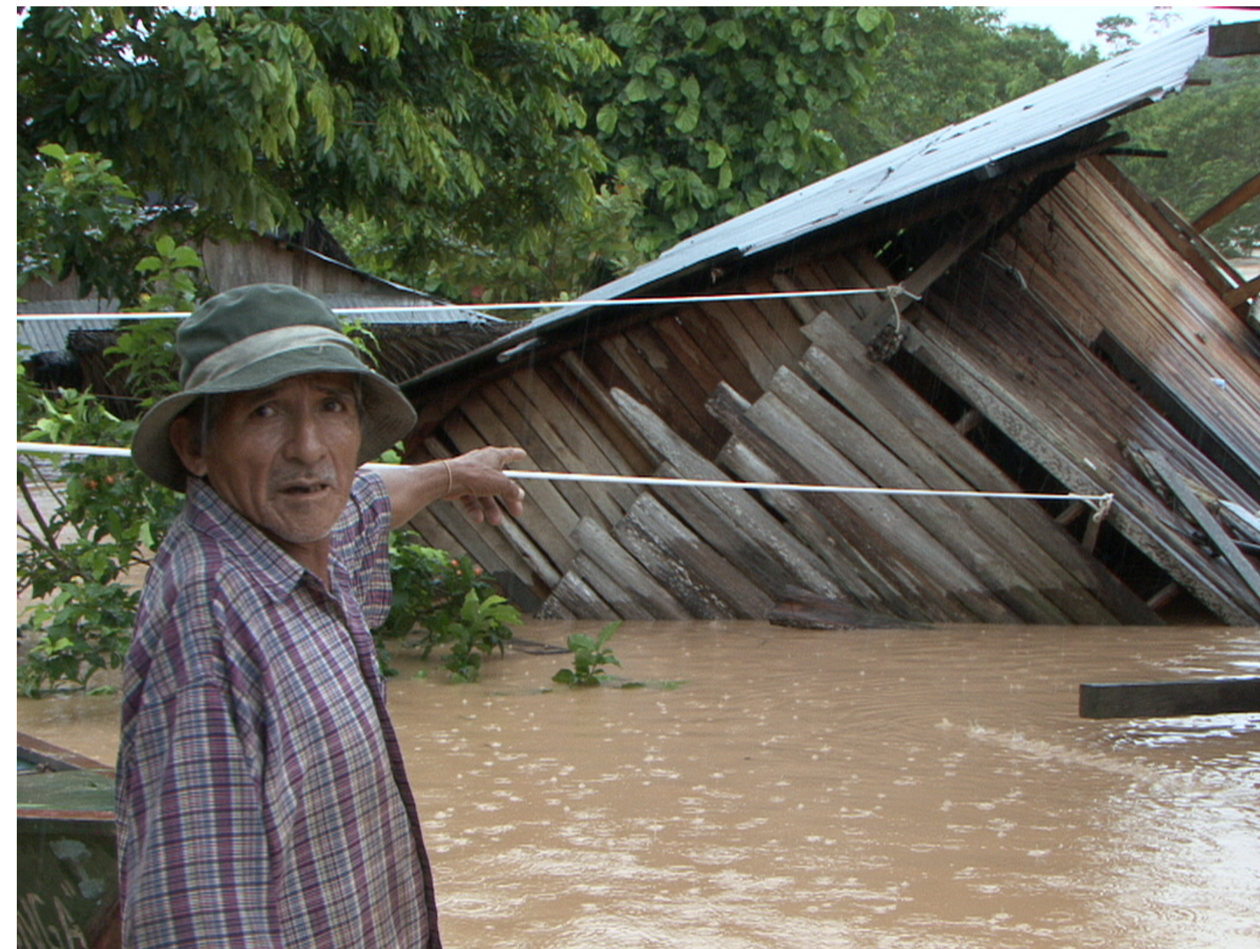
«Ucayali» Flood (Peru, 2011): loss of agricultural soils and houses

We report as sample some sustainable practices developed in a preventive way and during the response and recovery phases after disasters.