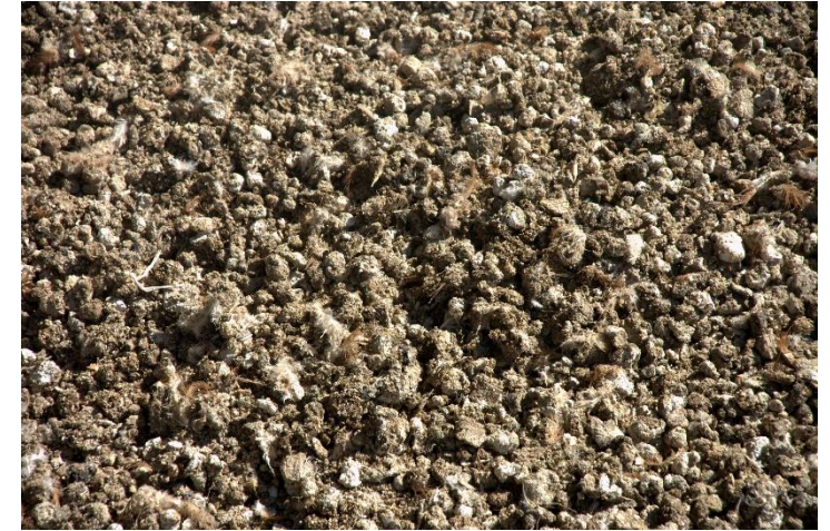
Figure 1. SMS

After the mushrooms are harvested, the "spent" substrate is removed from the houses and pasteurized with steam to kill insects, pathogens and mushroom remnants (figure 1)